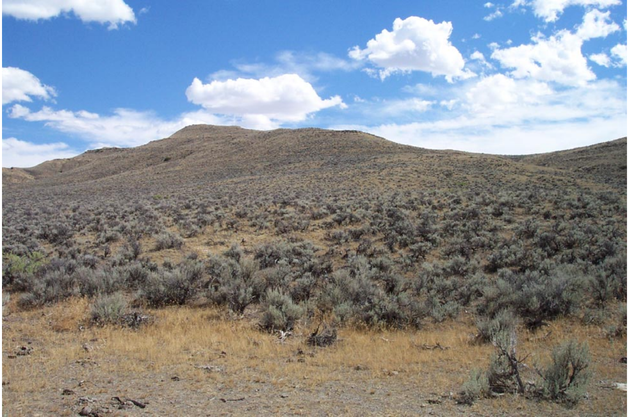
Long Draw Creek