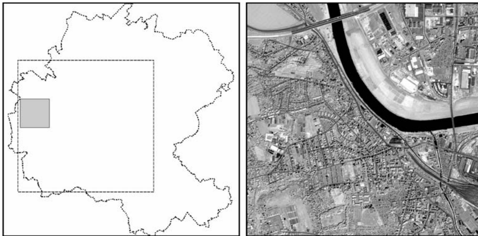
Figure 1. Location of the study area (shaded grey) in Dresden and within the overall IKONOS scene plus panchromatic image excerpt.

ground). Amongst the features are newly-built roads that are not recorded in the digital block data for Dresden (as at 1999), for instance.