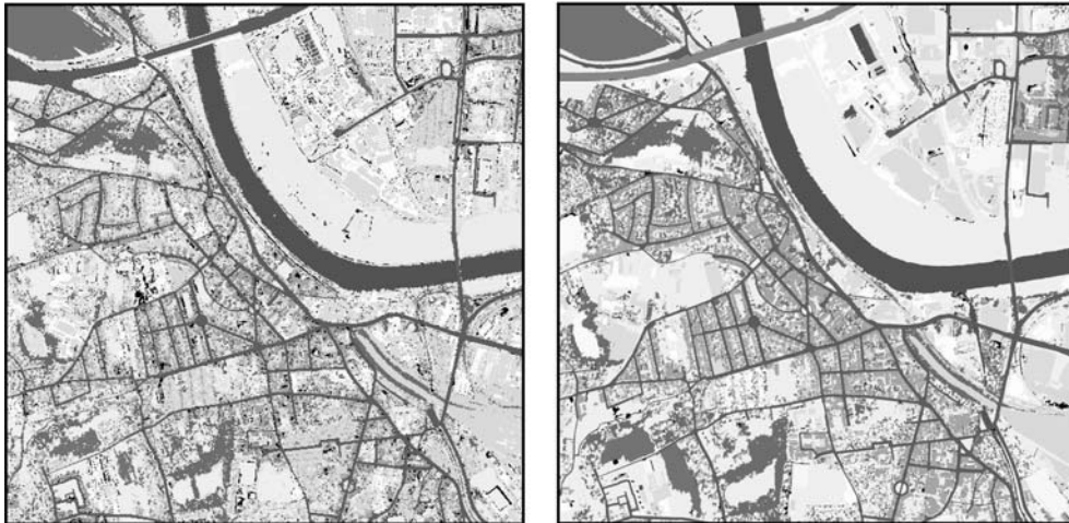
Figure 2: Classification results for the whole area (left: ExpertClassifier, right: eCognition).

Visual comparison of the two sets of classification results reveal marked differences (Fig. 2). Whereas eCognition yields very homogeneous areas due to segmentation beforehand, classification with ExpertClassifier results in well known small-element pixel classification pattern (“salt and pepper” effect).